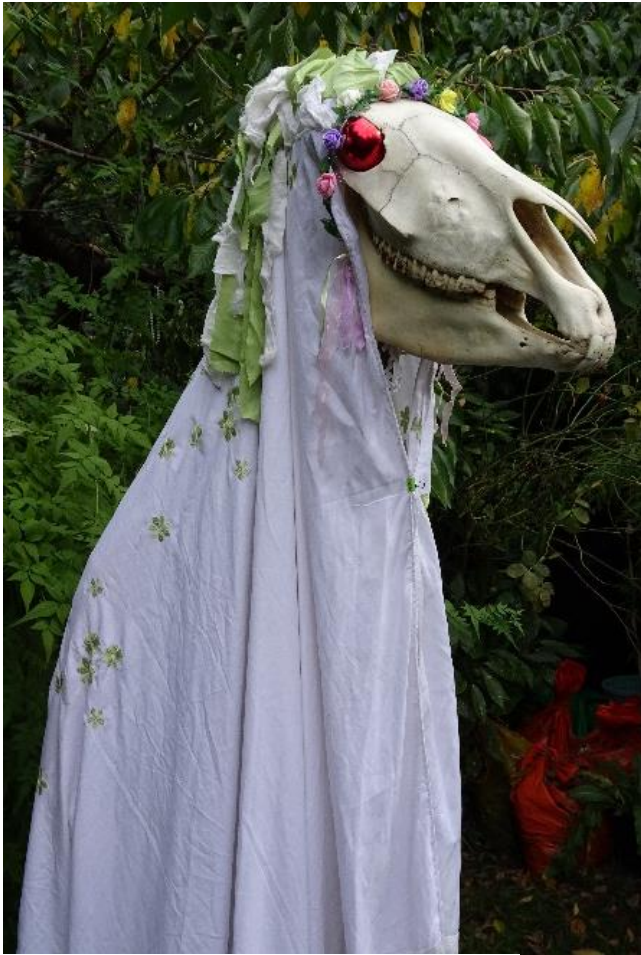
The Ickeny in his summer garb.