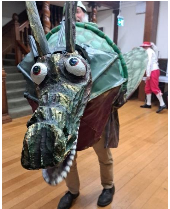
The author honoured to be able to try on the Snap costume at a Norfolk Folklore Society event, 20 th November 2024.