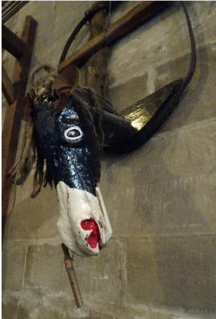
Abbots Bromley, 11 th September 2017