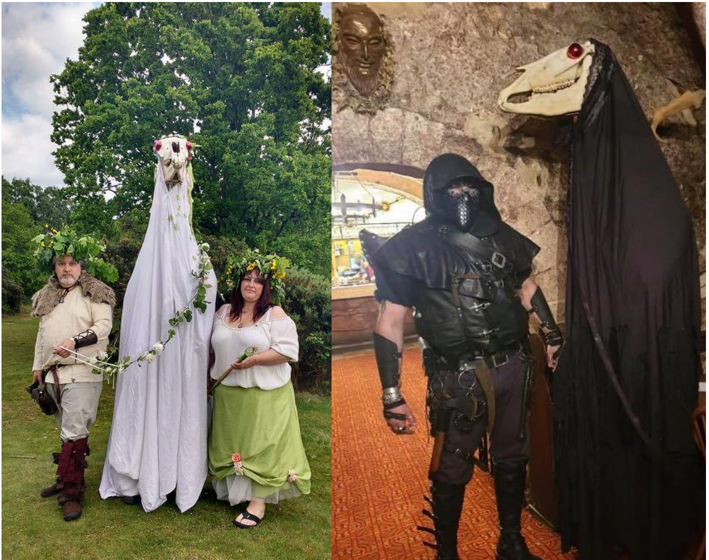
Left: The Ickeny at Norwich Moot's Beltane Ritual, 2017, on Mousehold Heath, with His 'prodders'. Right: The Ickeny put in an appearance at the Norfolk Goddess Temple's 2019 Enchanter's Ball at Jurnet's Bar.

He appears at Spring and Summer rituals, and at the annual Boudica's Brocante too. Occasionally, He can even be spotted at other people's events!