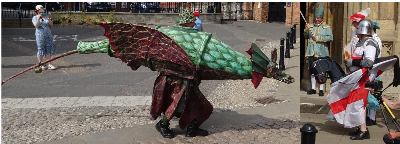
The Norwich Snap faces off against St George outside the Cathedral at the Civic Service, 11 th June 2023.